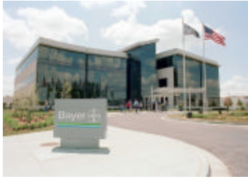
Bayer's North American Animal Health Headquarters located in Shawnee

Shawnee has taken many steps to further enhance our life sciences industry and attractiveness to new companies. These efforts include: